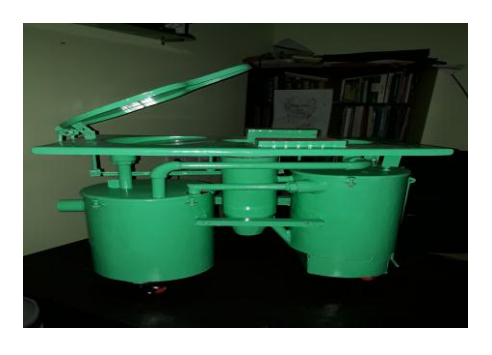
Figure 3: Bio-Toilet